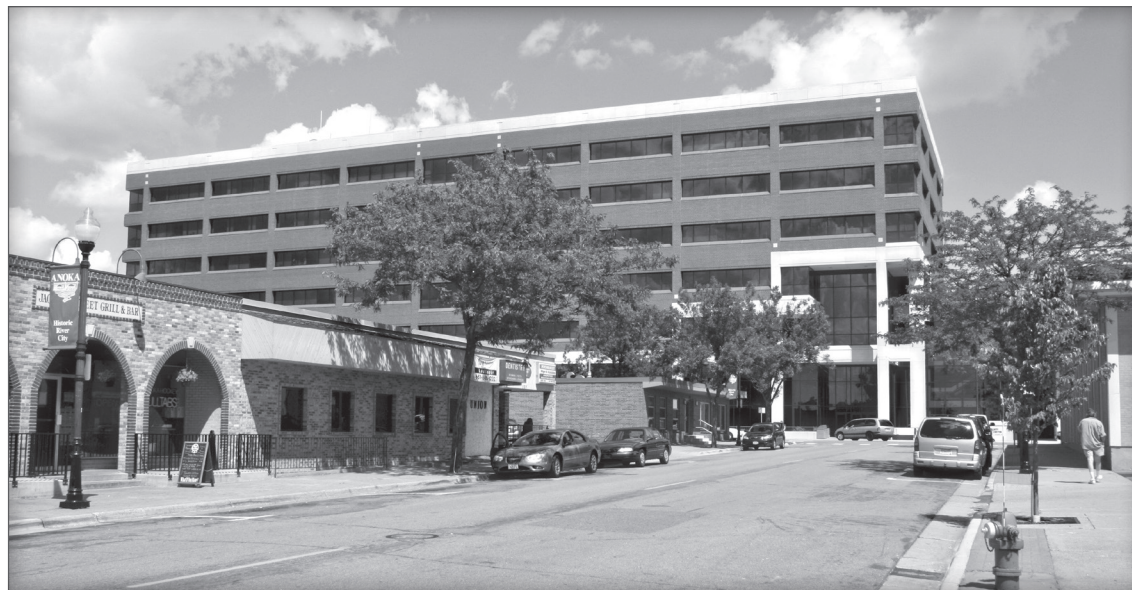
A view of the Anoka County Government Center from Jackson Street.

A FULL AND COMPLETE COPY OF THE COUNTY'S COMPREHENSIVE ANNUAL FINANCIAL STATEMENT IS AVAILABLE THROUGH OUR WEBSITE AT WWW.ANOKACOUNTY.US , UPON REQUEST BY CALLING (763) 324-4700, OR BY WRITING TO THE COUNTY ADMINISTRATOR, ANOKA COUNTY GOVERNMENT CENTER, 2100 THIRD AVENUE - ROOM 700, ANOKA, MN 55303