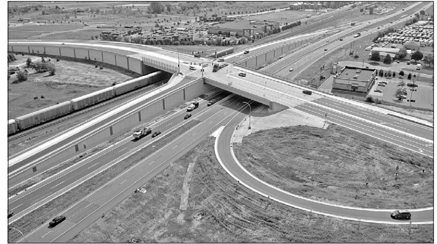
The new Armstrong Blvd. interchange over U.S. Hwy. 10/169 and the BNSF Railroad tracks in Ramsey opened in 2016. This is the first leg in planned safety and capacity improvement projects in the Hwy. 10/169 corridor.

Parks and Recreation included eight projects, totaling $2.7 million to improve and maintain the facilities at the Anoka County Parks. Most of these projects are funded with State, Met Council and other funds.