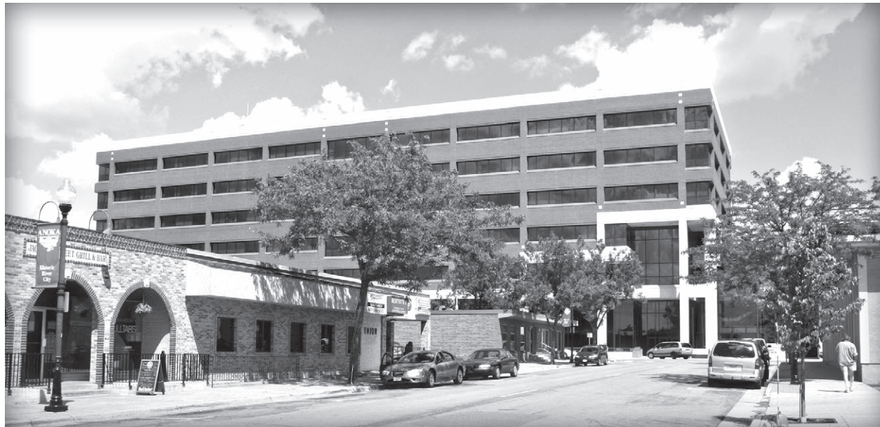
A view of the Anoka County Government Center from Jackson Street.

A FULL AND COMPLETE COPY OF THE COUNTY'S COMPREHENSIVE ANNUAL FINANCIAL STATEMENT IS AVAILABLE THROUGH OUR WEBSITE AT WWW.ANOKACOUNTY.US , UPON REQUEST BY CALLING (763) 324-4700, OR BY WRITING TO THE COUNTY ADMINISTRATOR, ANOKA COUNTY GOVERNMENT CENTER, 2100 THIRD AVENUE - ROOM 700, ANOKA, MN 55303