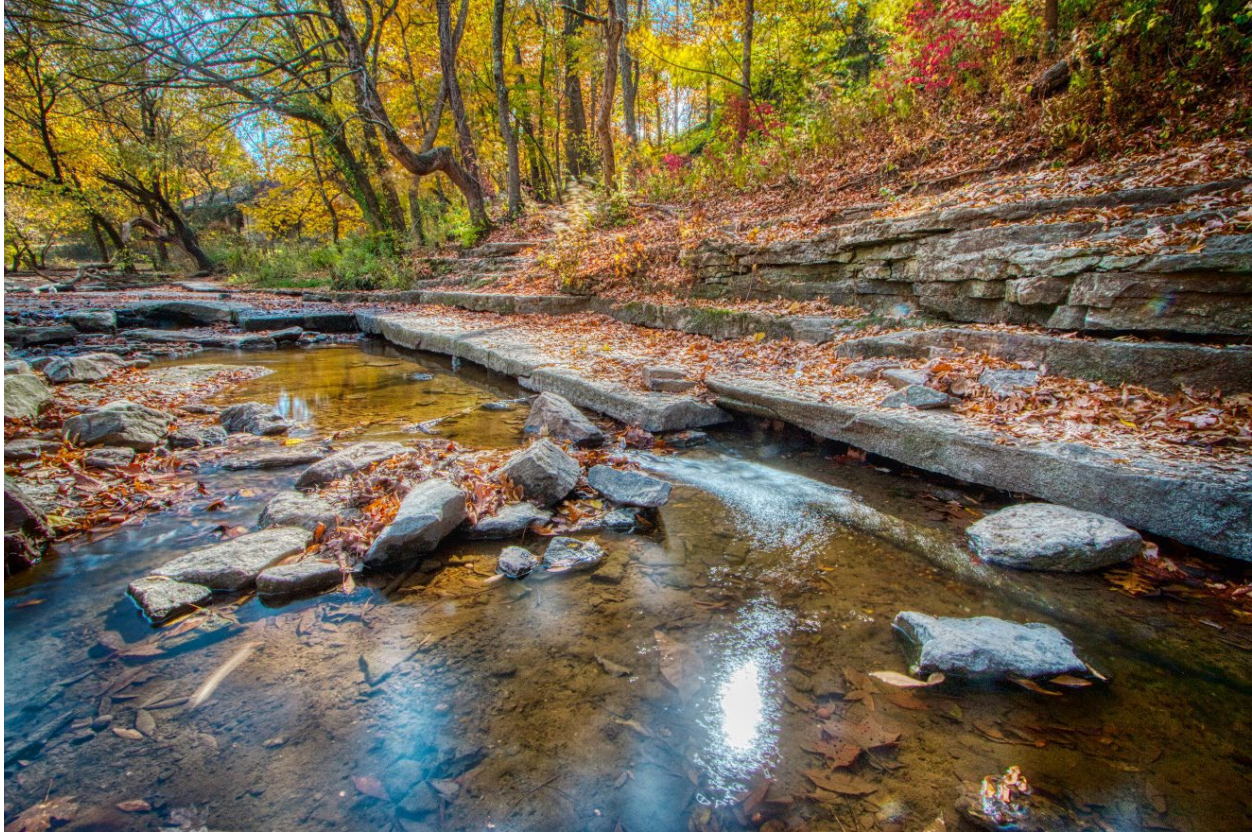
Middle Fork Beargrass Creek in Louisville's Cherokee Park